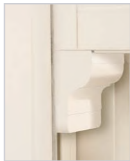
Sash Horns in 3 styles

“Sash horns add an elegant ornate finish to your windows – choose from three beautiful styles.”